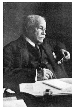
William Dean Howells in 1907