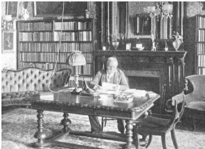
Picture of W. D. Howells in his study