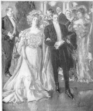
Illustration from The House of Mirth , 1905