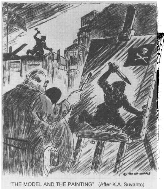
Figure 2. "The Model and the Painting," (After K. A. Suvanto).

bent on violence and repression distort the facts; they themselves are greedy and self-interested capitalists. Taken together, these claims lead to the obvious conclusion that we should not listen to those who attack the new Soviet experiment.