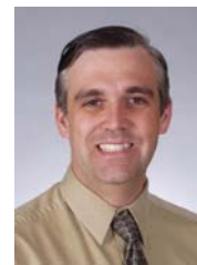
Dan Topping Anatomy